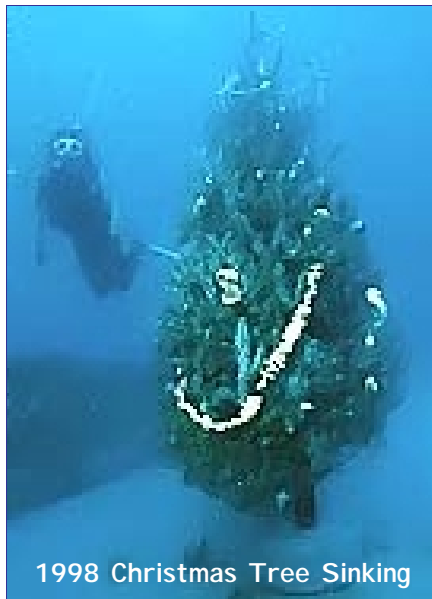
1998 Christmas Tree Sinking

rina and will cost $35, which includes the tip. If the weather doesn't cooperate, we'll try again December 22. Please join us for our annual ritual and add some unique memories to your logbook!